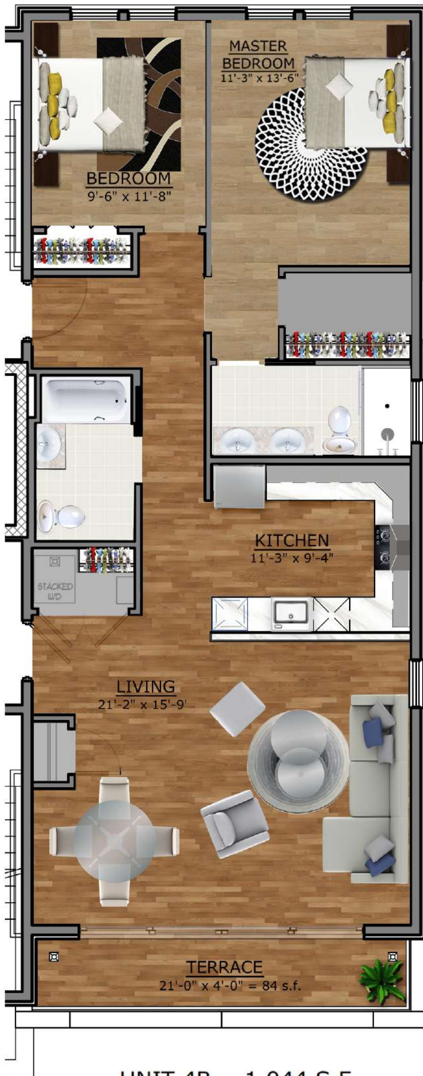
UNIT 4B - 1,044 S.F.