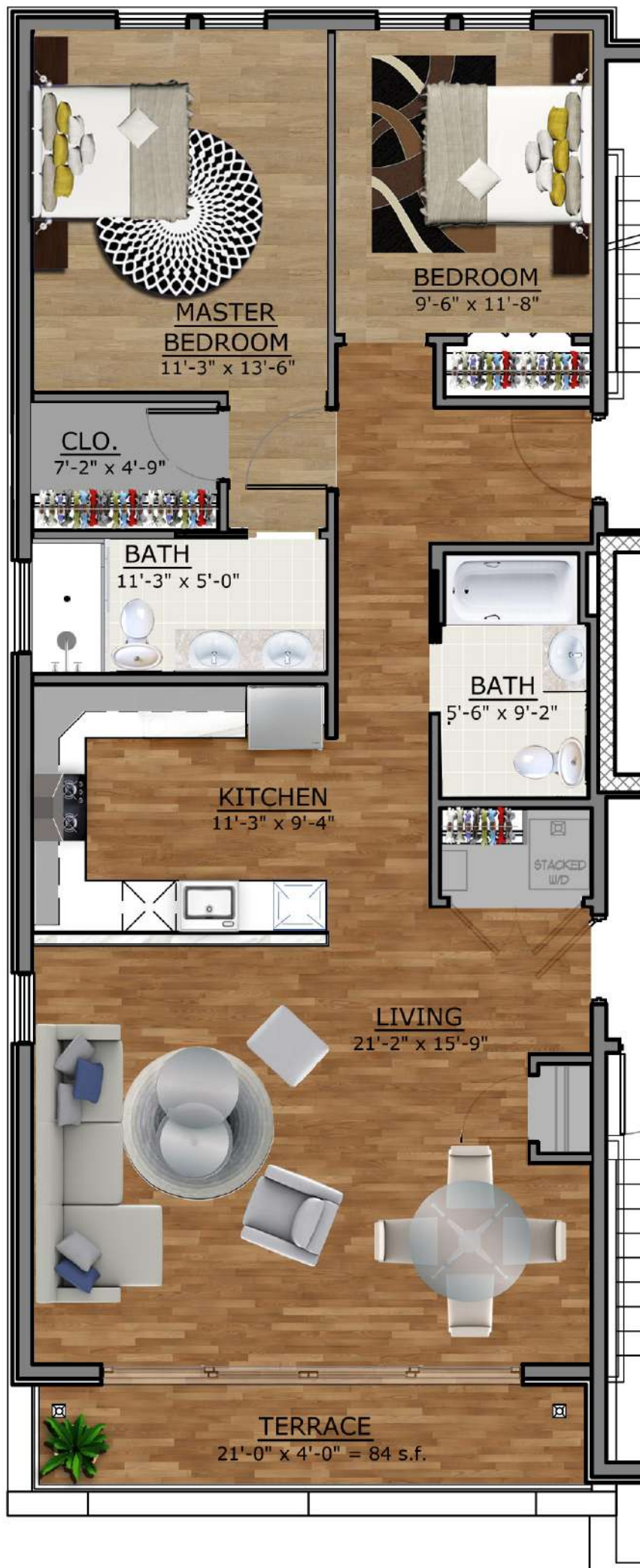
UNIT 4A - 1,044 S.F.